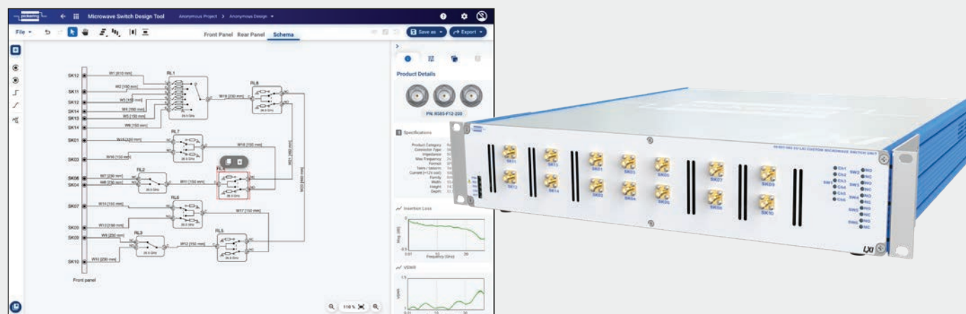
Figure 5 – Above, an example MSDT screen for a Turnkey LXI microwave switching solution and the corresponding unit.