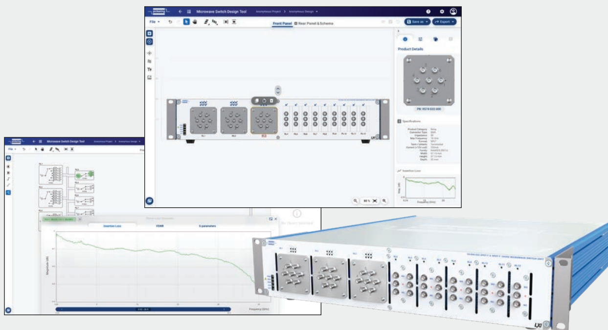
Figure 3 – Above, an example MSDT screens for a flexible LXI microwave switching solution and the corresponding unit.