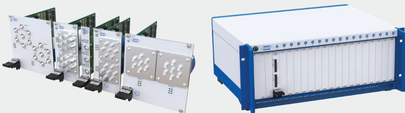
Figure 1 – Above, a range of PXI modules and a PXI chassis.

A PXI chassis provides power and cooling for PXI modules (figure 1 shows some examples), as well as a communication bus. Communication between the host PC and the PXI modules is either through a PCI bus extension module or through a host controller that is embedded in the PXI chassis. In this respect, PXI is very plug-and-play, and it could be that if the engineering team already has a PXI-based RF measurement system, implementing the tests could be as simple as adding a few switching modules and software drivers. The PXI form factor also delivers flexibility to custom-configure a COTS switching solution that consists of different switch topologies (SPDT, SP4T etc), frequency ranges (DC – 110 GHz) and self-termination options.